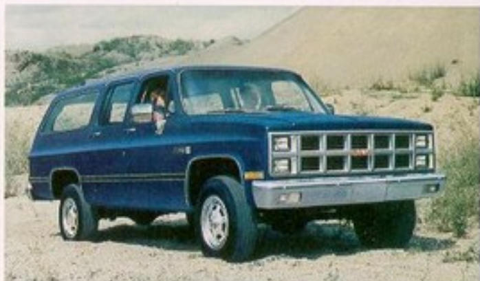
GMC 4-WD Suburban for off-road travel.

For off-road fun, consider the available new Front Quad Shock Package consisting of dual right and left 25-mm front shock absorbers and 32-mm rear shock absorbers. The package also includes a front axle pinion nose bumper mounted on the right frame side member to limit front axle windup.