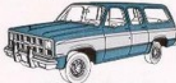
Available Exterior Decor Package