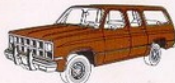
Standard Solid Color Scheme