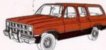
Available Special Two-Tone